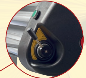
Easy access lever